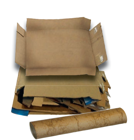
Cardboard Corrugated cardboard boxes, paper tubes & clean brown kraft paper