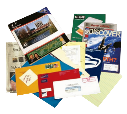
All clean & dry paper Office papers, newspapers, magazines, catalogs, brochures, phone books, file folders, envelopes, carbonless forms, junk mail

Plastic envelope windows, staples, and paper clips are okay.