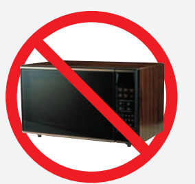
No appliances or electronics/eWaste