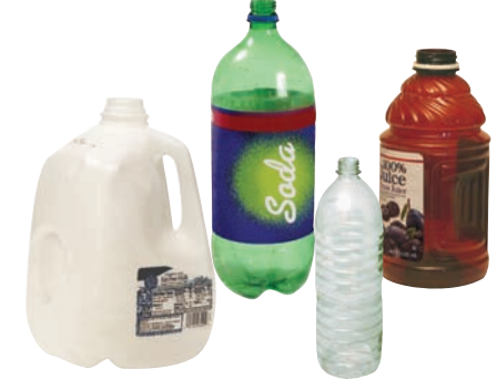
Plastic bottles, jars & jugs Container opening must be smaller than the base;