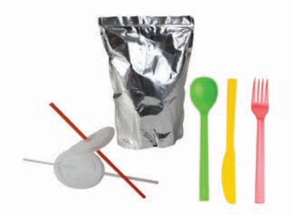
Pouches, straws & utensils