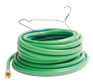
Hoses & wire