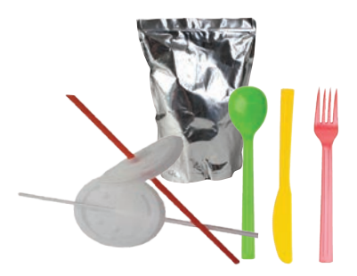
Pouches, straws & utensils