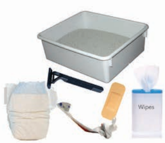
Hygiene, pet & medical