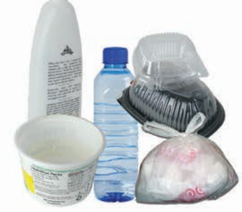
Plastics #1-7 (no foam) rtons