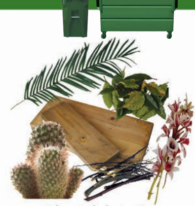
Plant debris & untreated wood