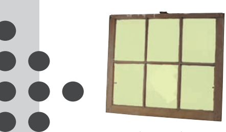
Sheet glass (window, mirrors, etc.)