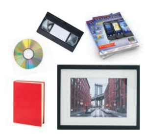
Books, CDs, VHS, DVDs, magazines, & framed pictures