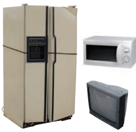
Housewares, TVs, electronics & appliances (remove or seal doors)