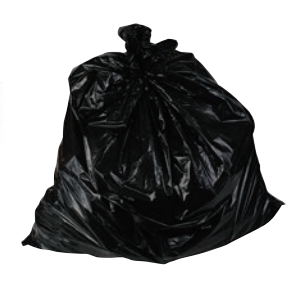
Trash that is bagged, boxed, or bundled