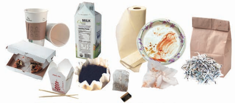
Food-soiled, beverage & shredded paper