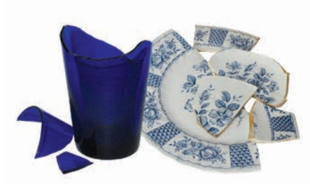
Glassware & ceramics