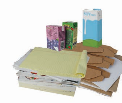
Clean paper, cardboard & shelf-stable (foil-lined) ca